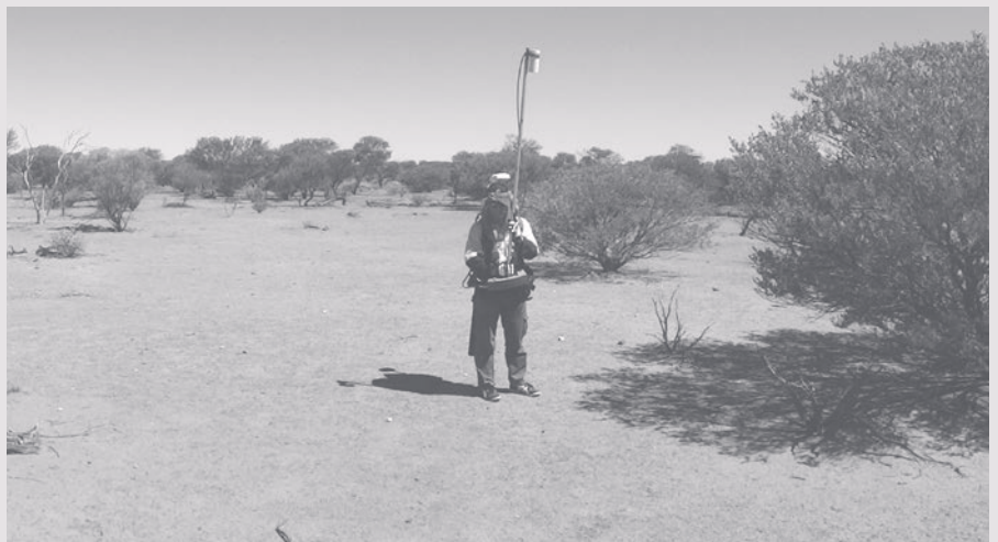
Picture: Magnetic Survey at Target 5, Cue Project.

* Bain & Co. The Global Diamond report 2013: Journey through the Value Chain. August 2013.