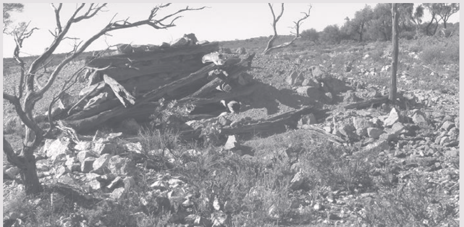
Picture: Old gold workings Corona Project.