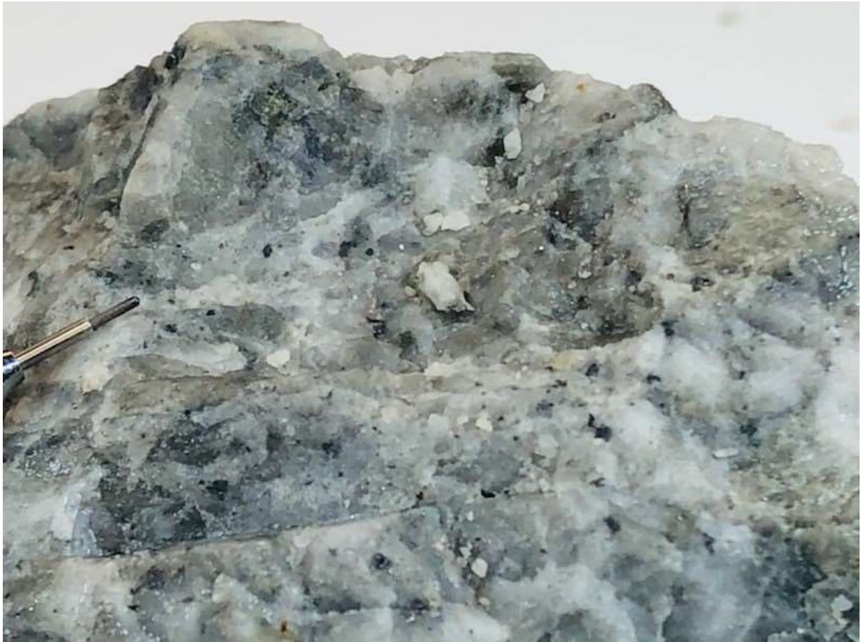
Sulphide minerals in quartz, drill sample close up, Clayton Silver-Gold Project, Nevada