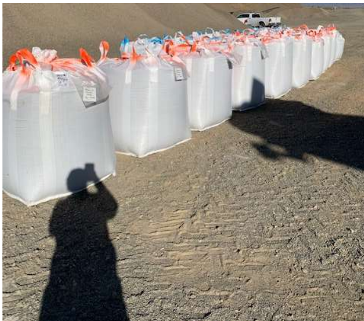
Perlite Product awaiting shipment

Shares in the Company trade on AIM. EPIC: "SRES". Website: www.sunriseresourcesplc.com