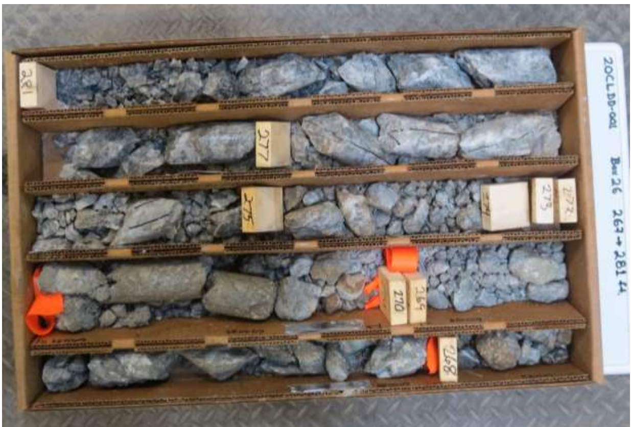
Drill Samples, Clayton Silver-Gold Project, Nevada