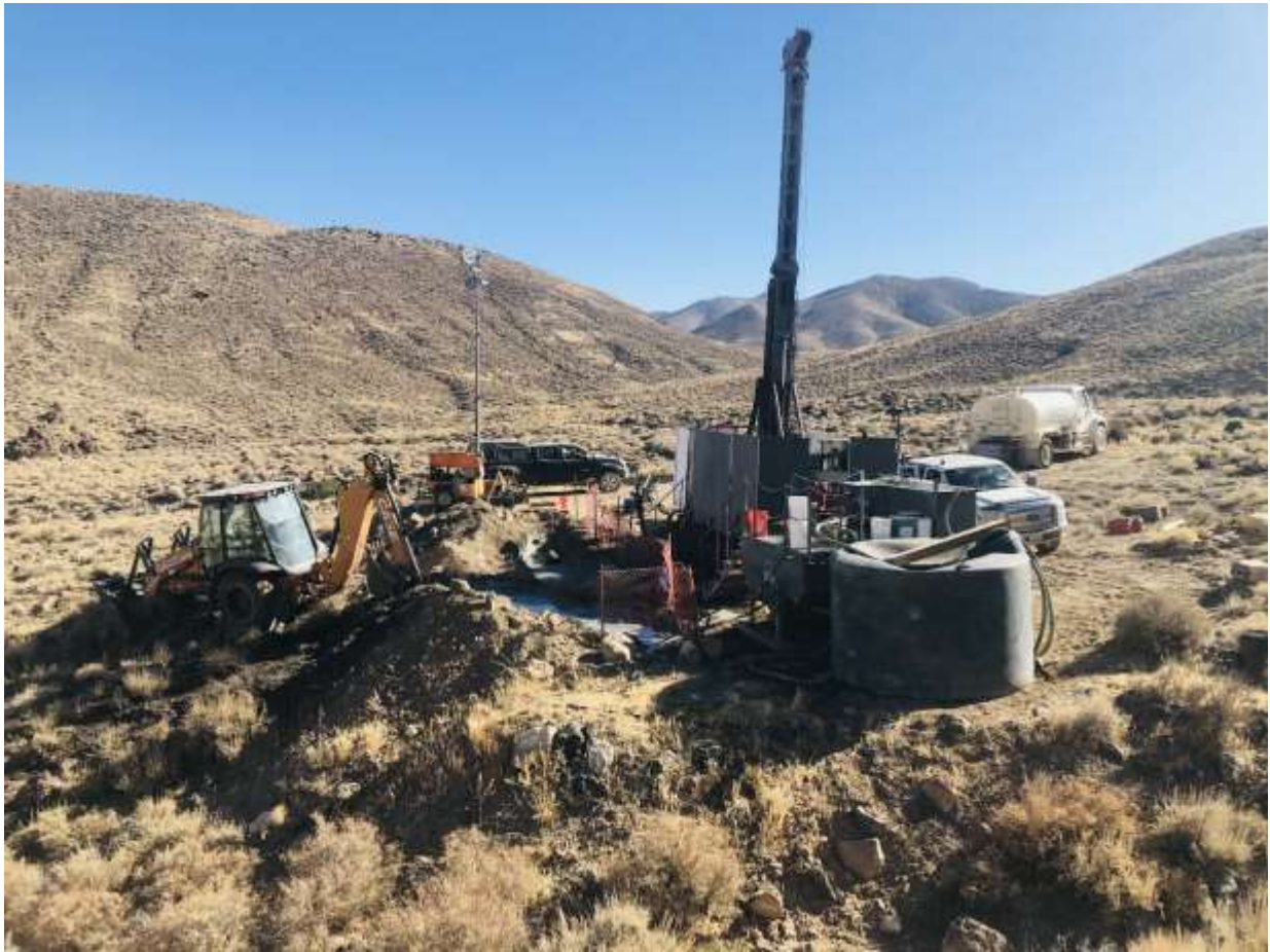
Drilling at Clayton Silver-Gold Project, Nevada